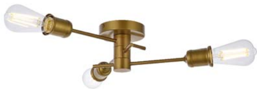
Brass Item No:LD7049F18BR