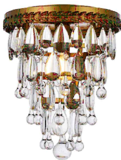
Brass Item No:1219F9BR/RC