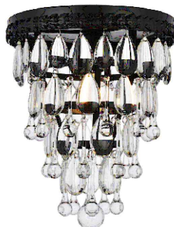
Black Item No:1219F9BK/RC